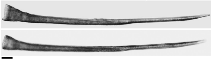
Figure 2. Light microscopy photographs of two darts of Polymita muscarum in side view. Cross-sections of the dart are circular, i.e., without blades. (Scale bar = 100 \mu\text{m} .)

zone is perhaps best described as ‘rubbing’. During the rubbing motion the dart apparatus is partially extended (fig. 1B) and seems to make small (semi-)circular movements.